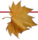
World Narince Day, June 2023, Istanbul