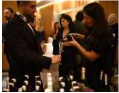
TWC Wine Festival May/June 2023, London